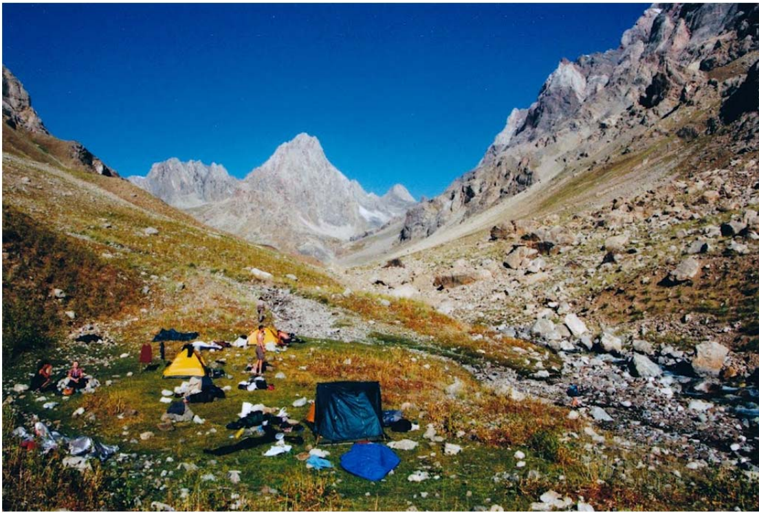
Kaznoki org, laager ca 3500