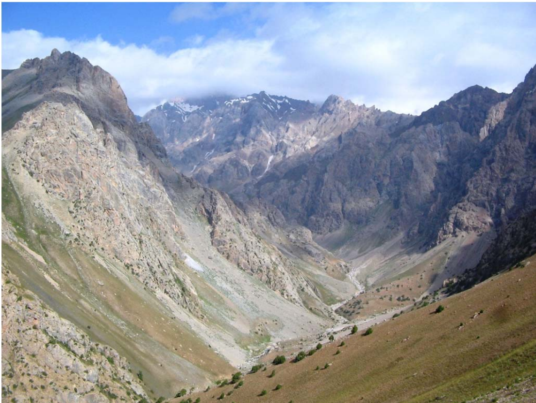
Kaznoki org ca 3000, vaade Suvtori külgorust