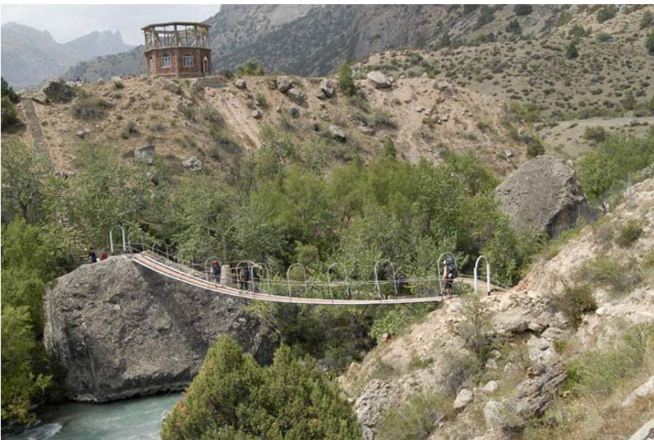
Uus sild Sarõtagi juures